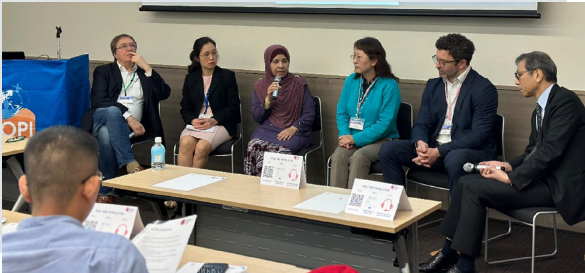
Panel of experts discussing challenging cases on APDS diagnosis and HSCT for congenital neutropenia for the region (APSID role)