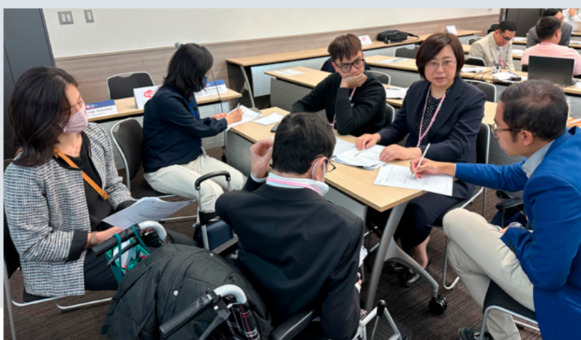
Patient leaders collaborating with doctors to develop specific action plans to tackle challenges in a country.