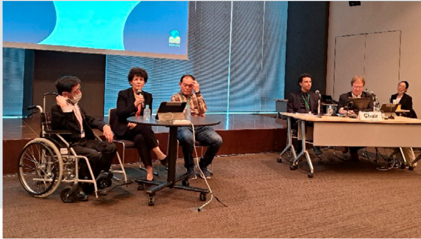
Panel discussion on the PID Life Odyssey - the Patient Journey