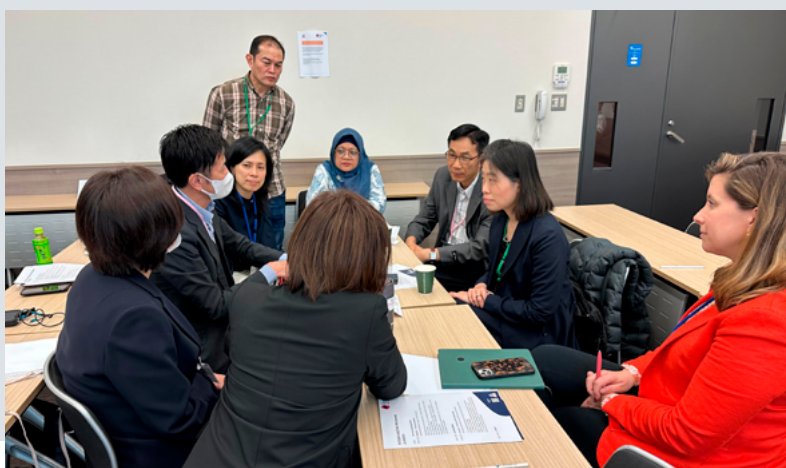
Group discussions aimed at addressing how to manage daily life with a PID