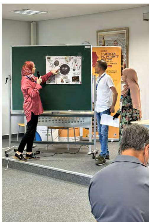
Campaigns presentation and interactive role-playing