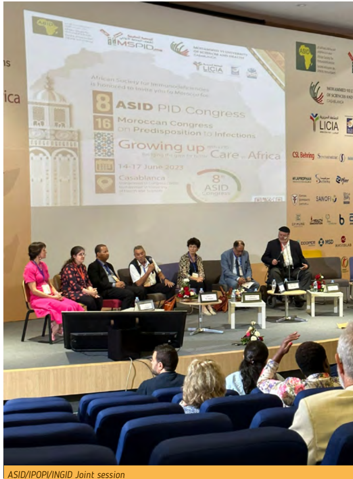
ASID/IPOPI/INGID Joint session

The ASID meeting commenced with short addresses from representatives from regional and international organisations, comprising doctors, patients, and nurses, underscoring the vital significance of comprehensive collaboration between all stakeholders for improved care of PID patients.