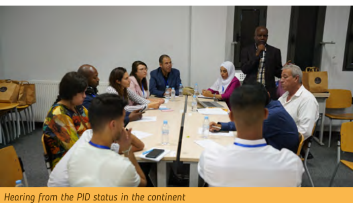
Hearing from the PID status in the continent