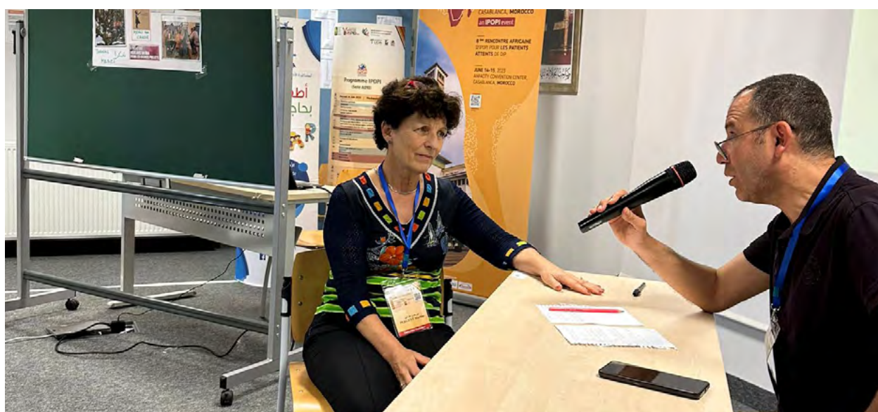
Campaigns presentation and interactive role-playing