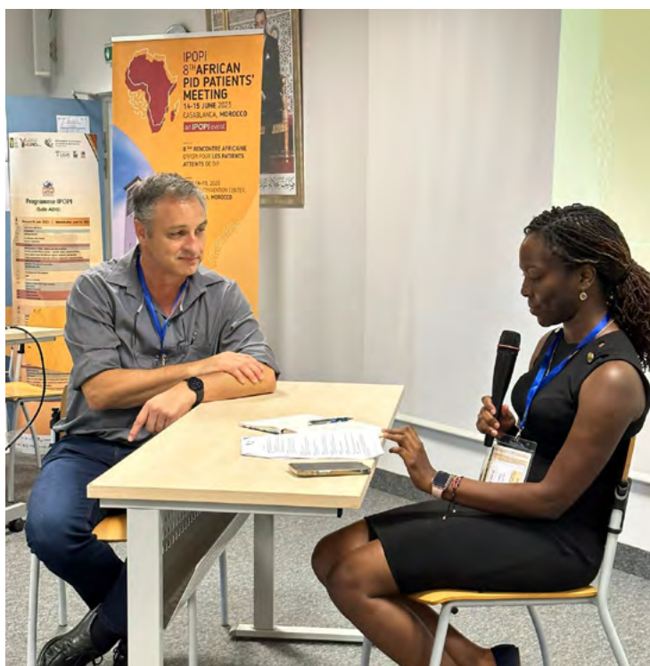
Campaigns presentation and interactive role-playing