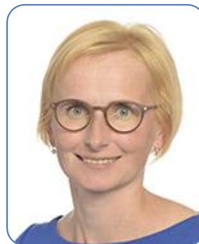
(GUE/NGL, Czech Republic)