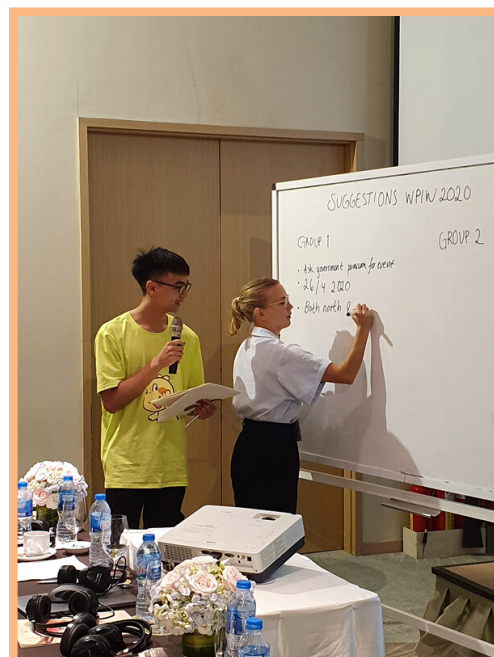
Reporting results from the workshop