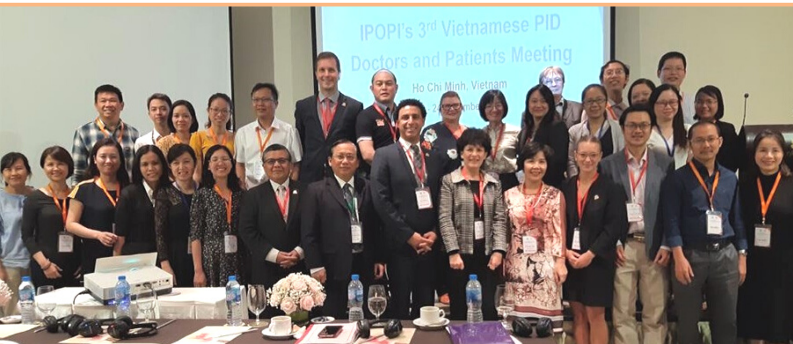
Speakers, staff and part of participants, doctors meeting 23 November