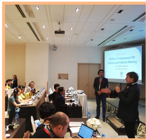
Question & Answer session