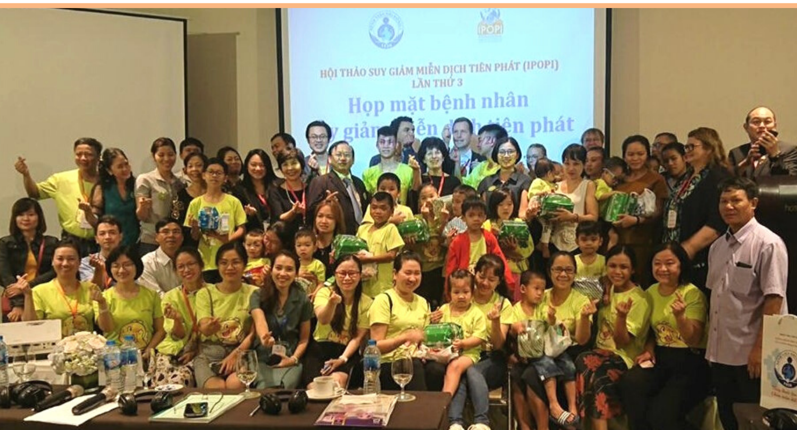
IPOPI delegation, speakers and patient representatives, PID patients meeting 24 November